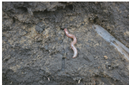
Earthworms work to improve soil structure.

AGRIRSERUM® will work in your soil to restore the biological life, namely, bacteria; and this will create a soil condition that is favorable to the proliferation of the very desirable earthworm. Earthworms are major decomposers of dead and decomposing organic material and their nutrition comes from bacteria and fungi that grow on the organic material. Earthworms play a big part in soil structure, water movement, nutrient cycling, and plant growth. The presence of earthworms is an indication of a healthy ecosystem.